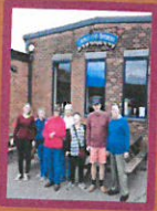
CHURCH END BREWERY TOUR